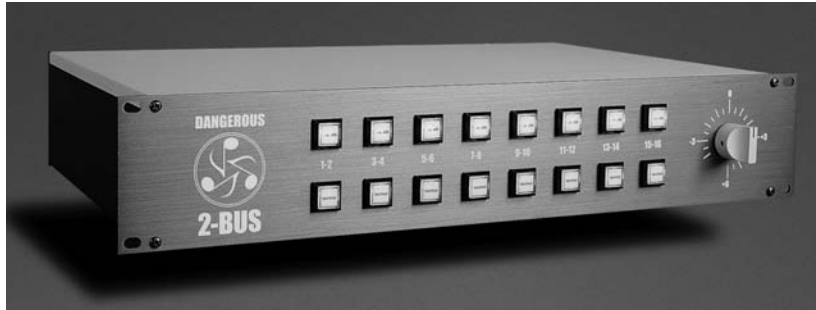
Dangerous 2-BUS Front