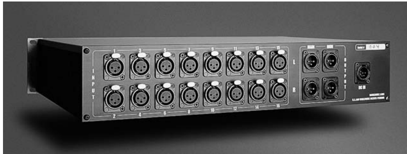
Dangerous 2-BUS Rear